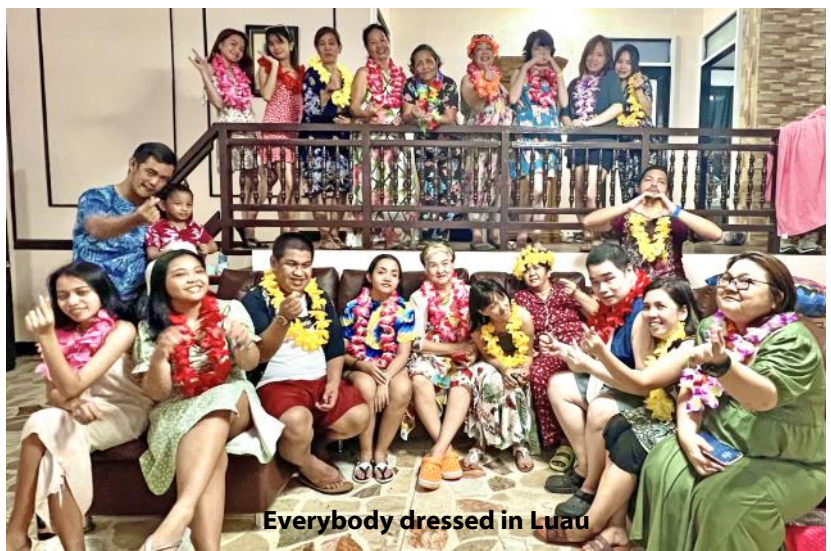
Everybody dressed in Luau

The Philippines is part of the province Colours of Asia together with Malaysia, Pakistan, Singapore and India