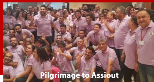
Pilgrimage to Assiout