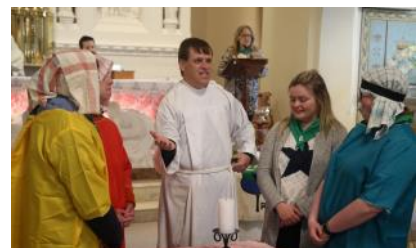
Members of Faith and Light enact the Gospel story "The Road to Emmaüs" at the celebration of Mass in the parish church of St John the Baptist.