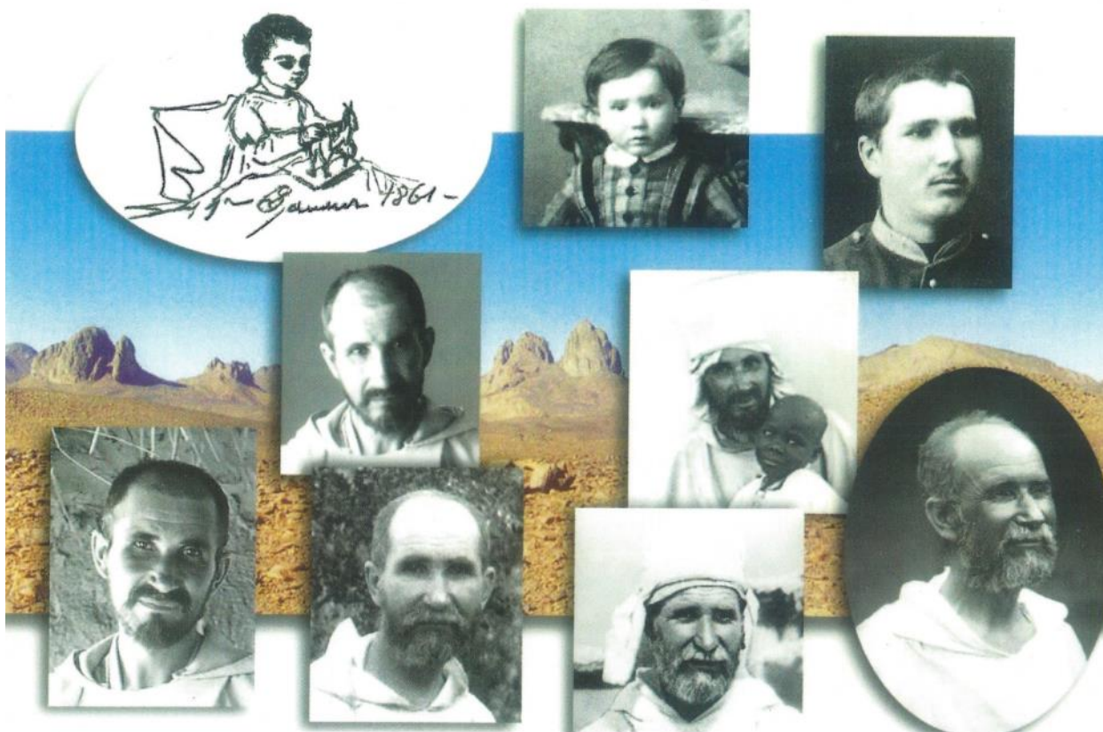
Saint Charles at different ages of his life