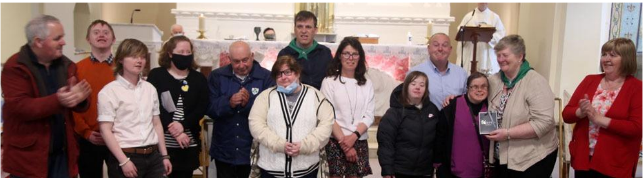
Members of Faith and Light sing a hymn at the end of the Mass

THIS ARTICLE WAS PUBLISHED IN THE « IRISH CATHOLIC » NEWSPAPER FOLLOWING THE PILGRIMAGE WHICH WAS FINALLY ABLE TO TAKE PLACE IN PERSON LAST MAY AFTER TWO YEARS OF VIRTUAL PILGRIMAGES. A LOOK BACK AT THIS DAY OF GATHERING AND CELEBRATION.