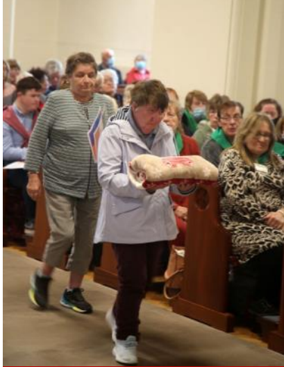
Procession of offerings