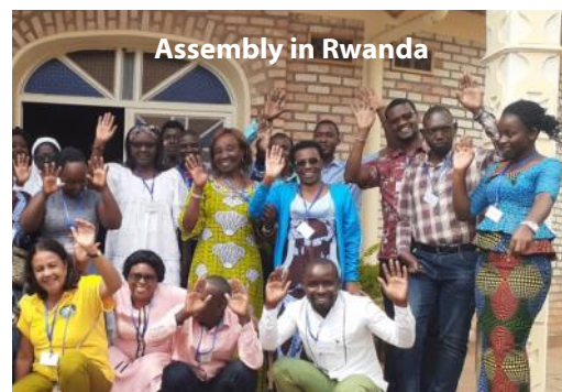
Assembly in Rwanda