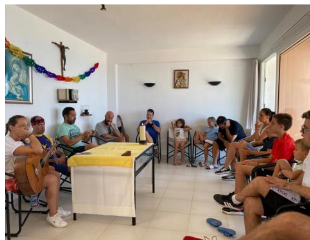
"Abba" community, time of prayer