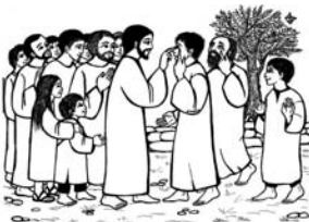
The man born blind