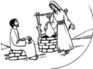
The Samaritan woman