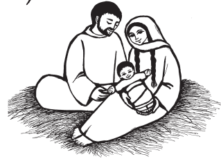
Mary and Joseph