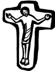
The good thief