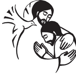
John, the beloved disciple