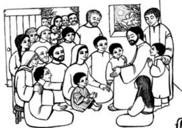
The little children